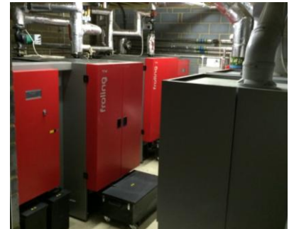
Biomass Boiler Plant